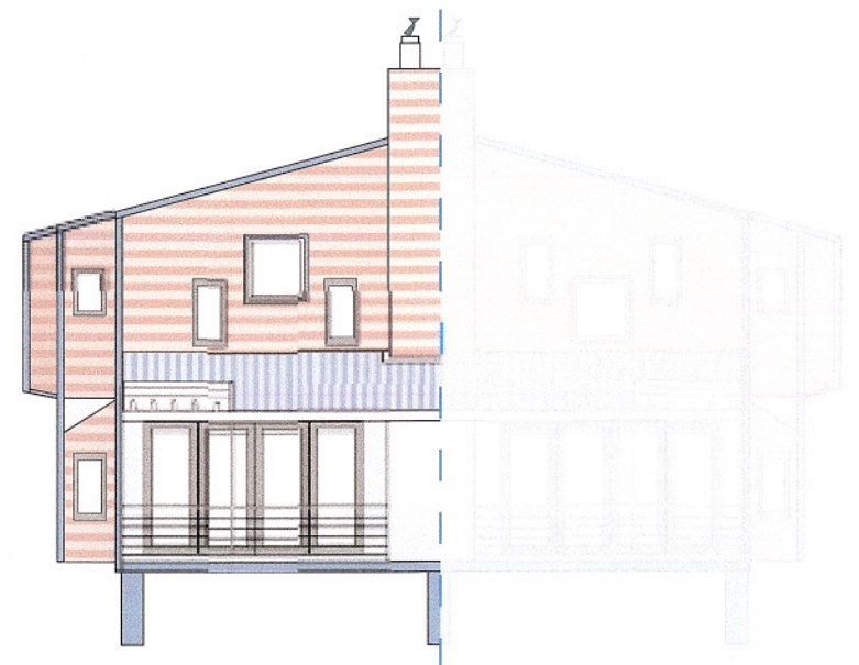
3 bedroom unit

The AUSTRALIAN LAND COMPANY Pty Limited LAKE CRACKENBACK RESORT 02 6456 1101 www.lakecrackebackresort.com.au